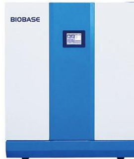
Double-layer Door (D type)