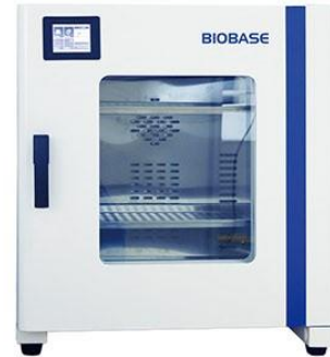
Glass Viewing Window Door (G type)